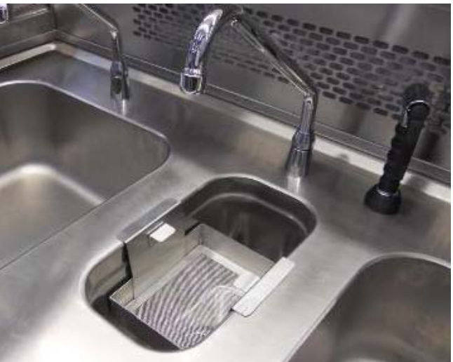
Cover for formalin sink