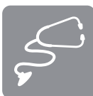
Home Nursing Care