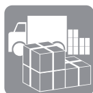
Pick-up and Delivery