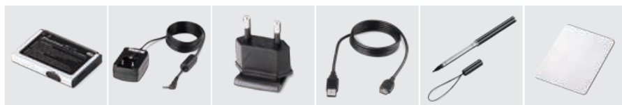
Battery Adapter Plug Adapter USB Cable Stylus Pen Protection Film