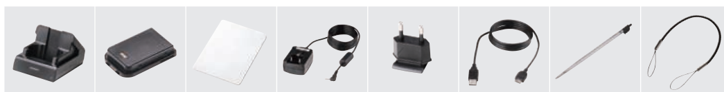
Cradle Battery Protection Film Adapter Adapter Connector USB Cable Stylus Pen Tether