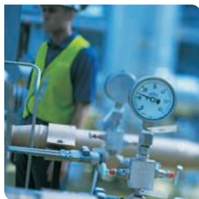
Field Force Automation