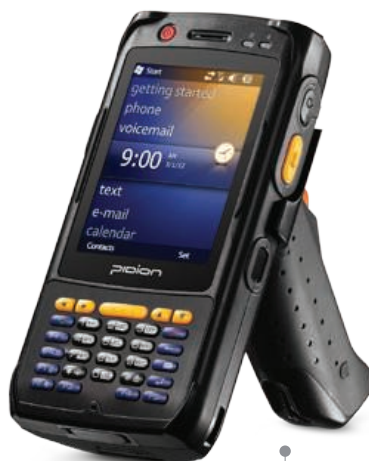
BIP-6000MaxGrip Pistol Grip