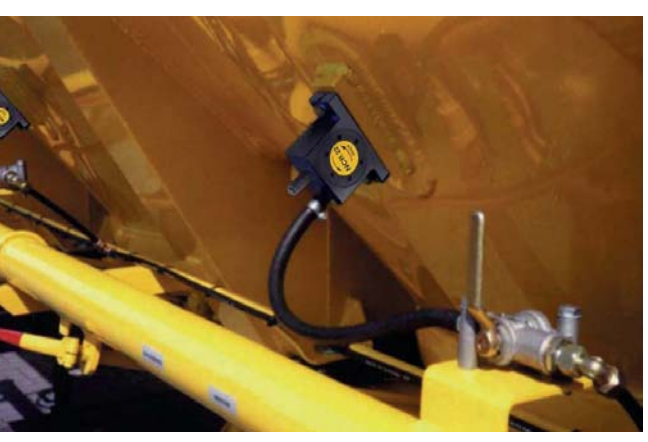
Emptying silo trailers