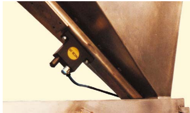
Emptying without bridging