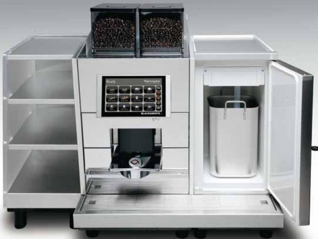
CTM & CH