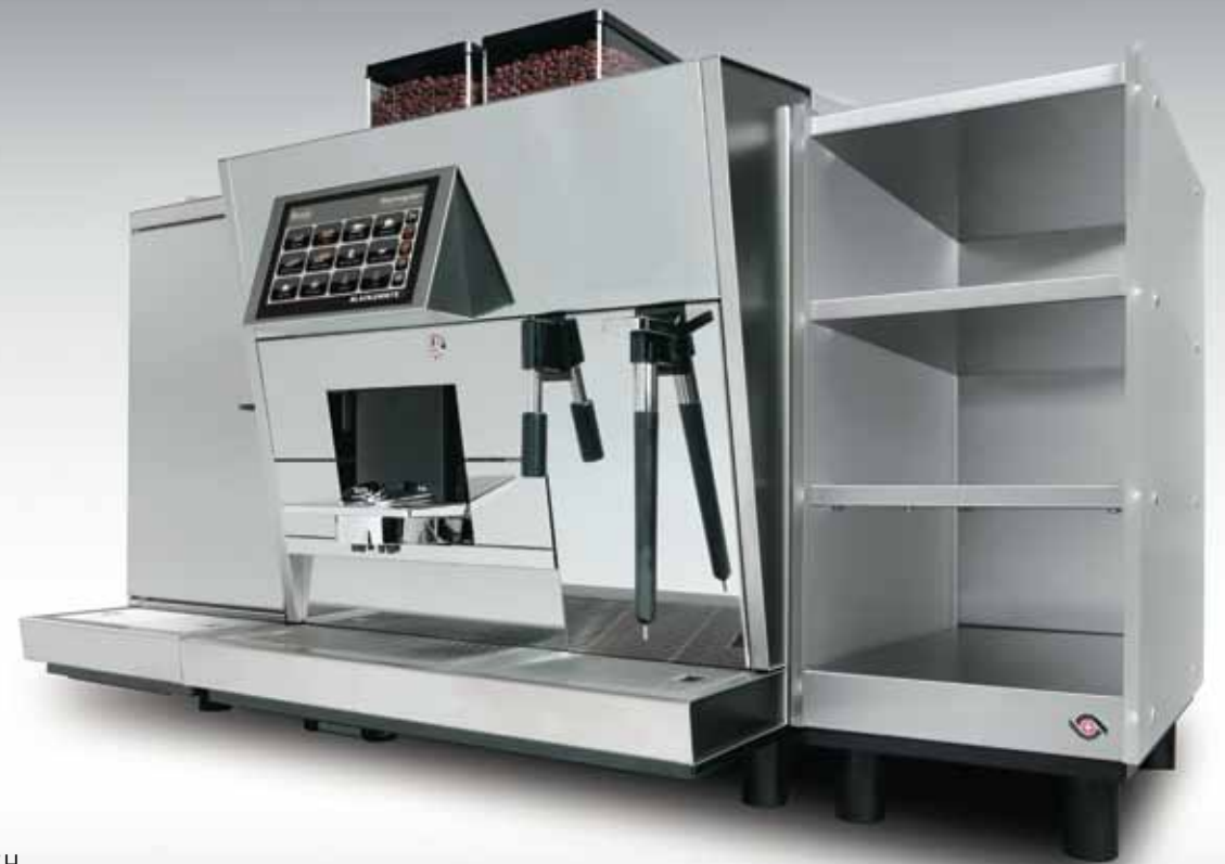
CTMS & CH

Use the CH to preheat the coffee cups to get ready for an extraordinary coffee enjoyment.