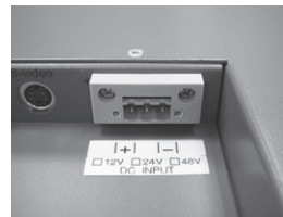
▲ Phoenix-type power input