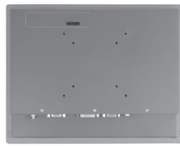
▲ Various mounting ways Panel/Wall/VESA