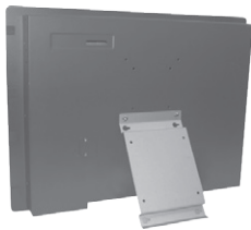
▲ Stand kit