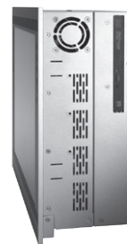
▲ Expandible design