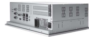
▲ Less screw design