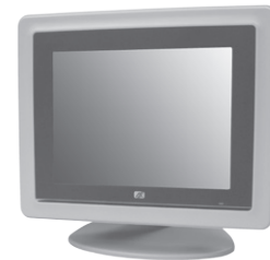
▲ Desktop stand