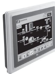
▲ Side view