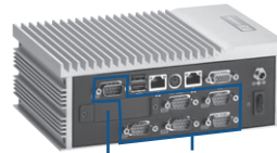
Front access CF slot