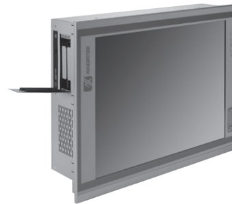
▲ HDD easy maintenance