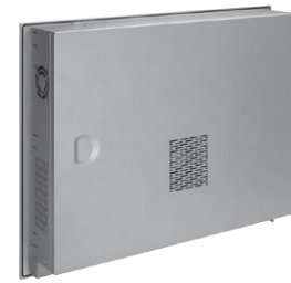
▲ Less screw design