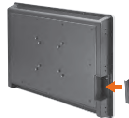
▲ CompactFlash™ slot with protective cover