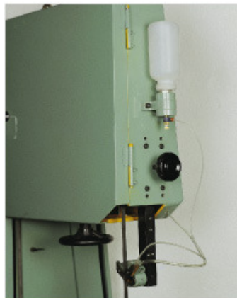
SPRAY MIST COOLANT ATTACHMENT