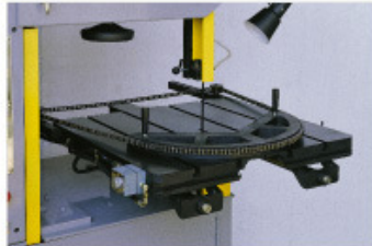
WORK HOLDING JAW