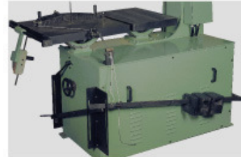
GRAVITY FEED ATTACHMENT