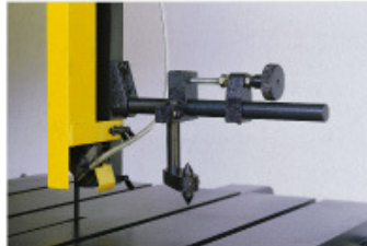
CIRCLE CUTTING ATTACHMENT