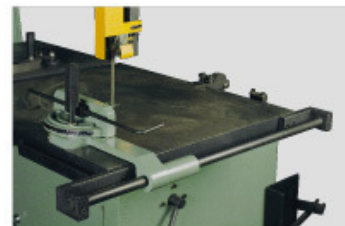
MITER GAUGE, FIXED TABLE