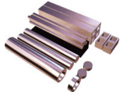
For cutting hard to work materials such as stainless, monel, nickel, inconel, titanium etc.