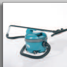
Easy to handle