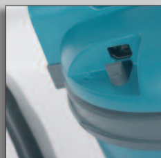
Quick replaceable cable